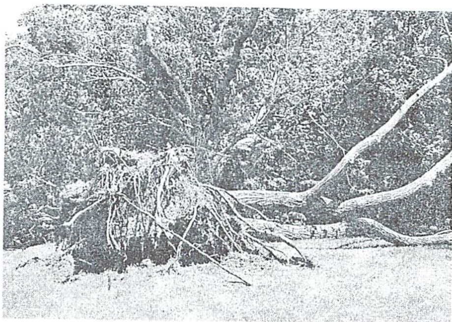
An enormous tree on Standish Shore was uprooted by the violent thunderstorm on the afternoon of June 22.